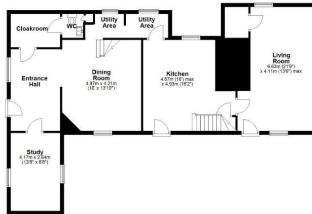
First Floor Approx. 87.3 sq. metres (940.0 sq. feet)