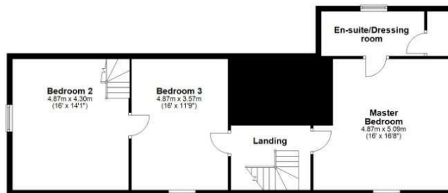
Total area: approx. 243.2 sq. metres (2617.5 sq. feet)