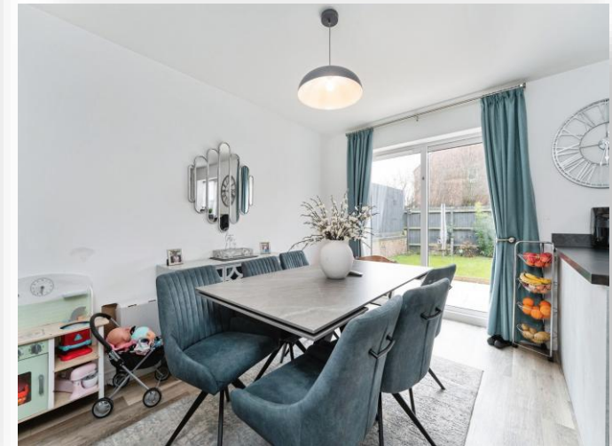
Lowfield Crescent, Littleport CB6 1FP