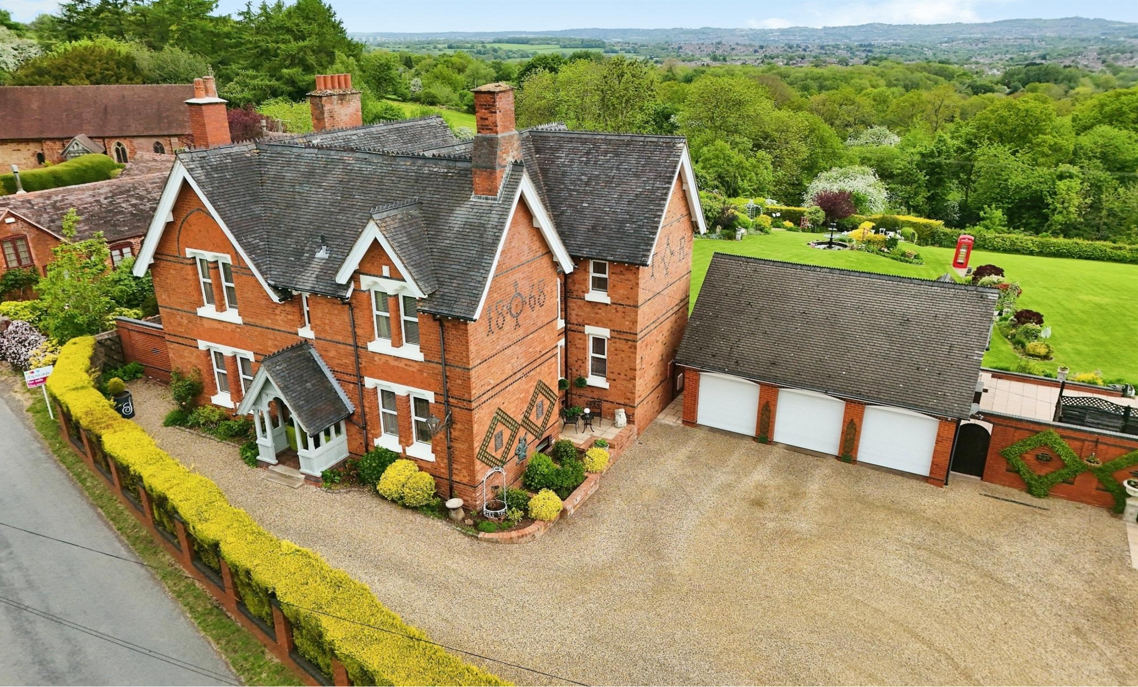
Chapel Farm, Chapel Lane, Romsley, B62 0NG