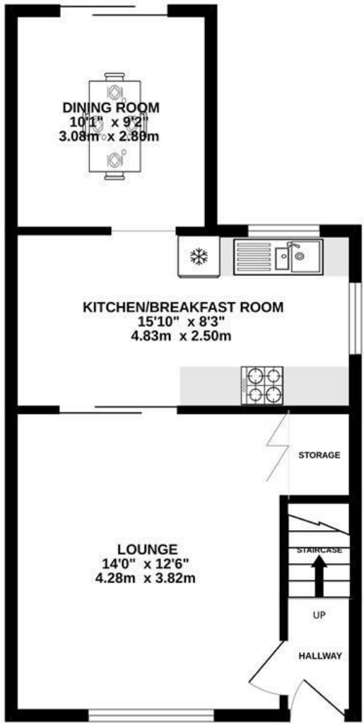
GROUND FLOOR 445 sq.ft. (41.4 sq.m.) approx.