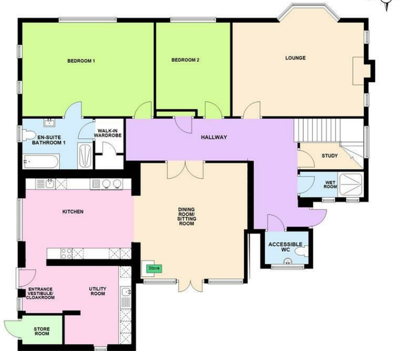
CRAIGIELEA HOUSE GROUND FLOOR