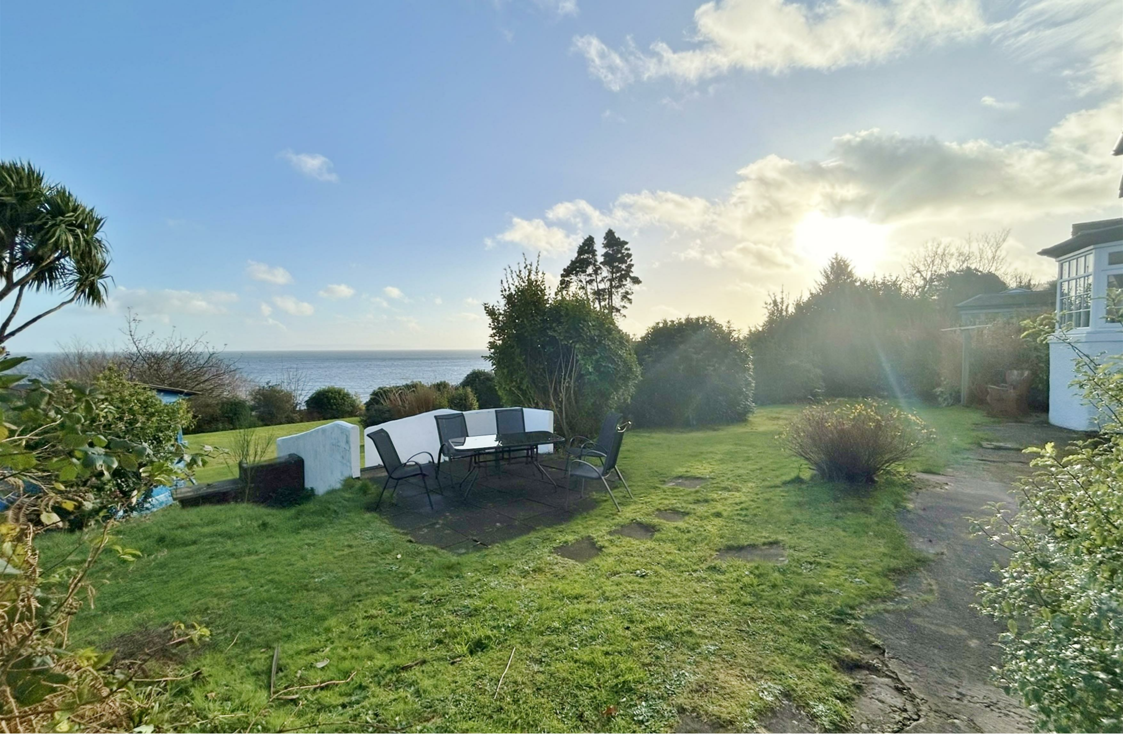
Craigielea House Rosemount Road, Whiting Bay, Isle Of Arran, KA27 8PR