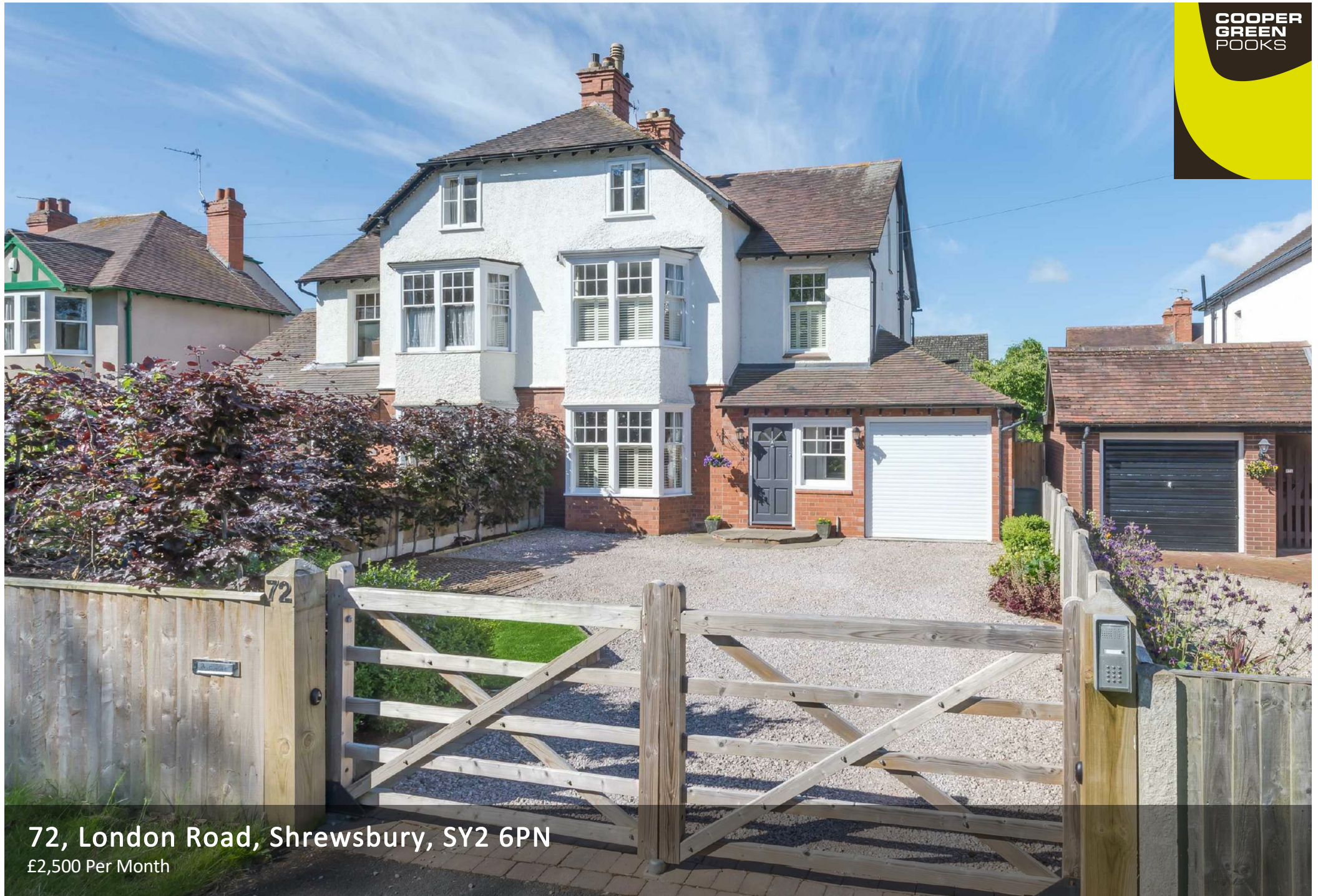
72, London Road, Shrewsbury, SY2 6PN £2,500 Per Month