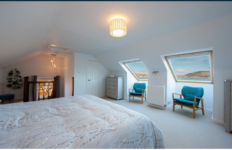
Bedroom 2: 3.38m x 2.97m, window to rear, central heating radiator, ceiling light fitting, fitted carpet.