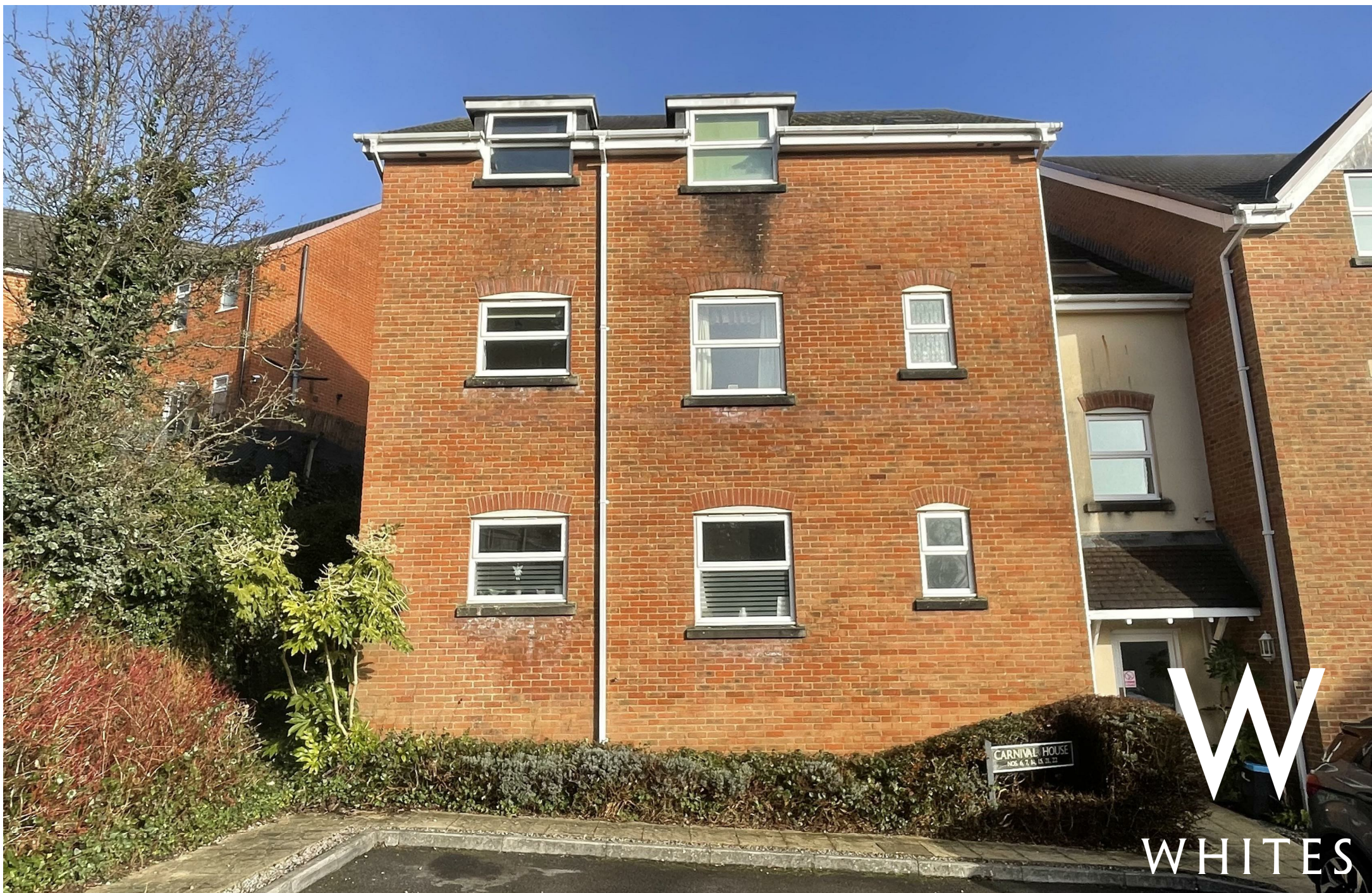
15 Carnival House, Jubilee Close, Salisbury, Wiltshire, SP2 9ER