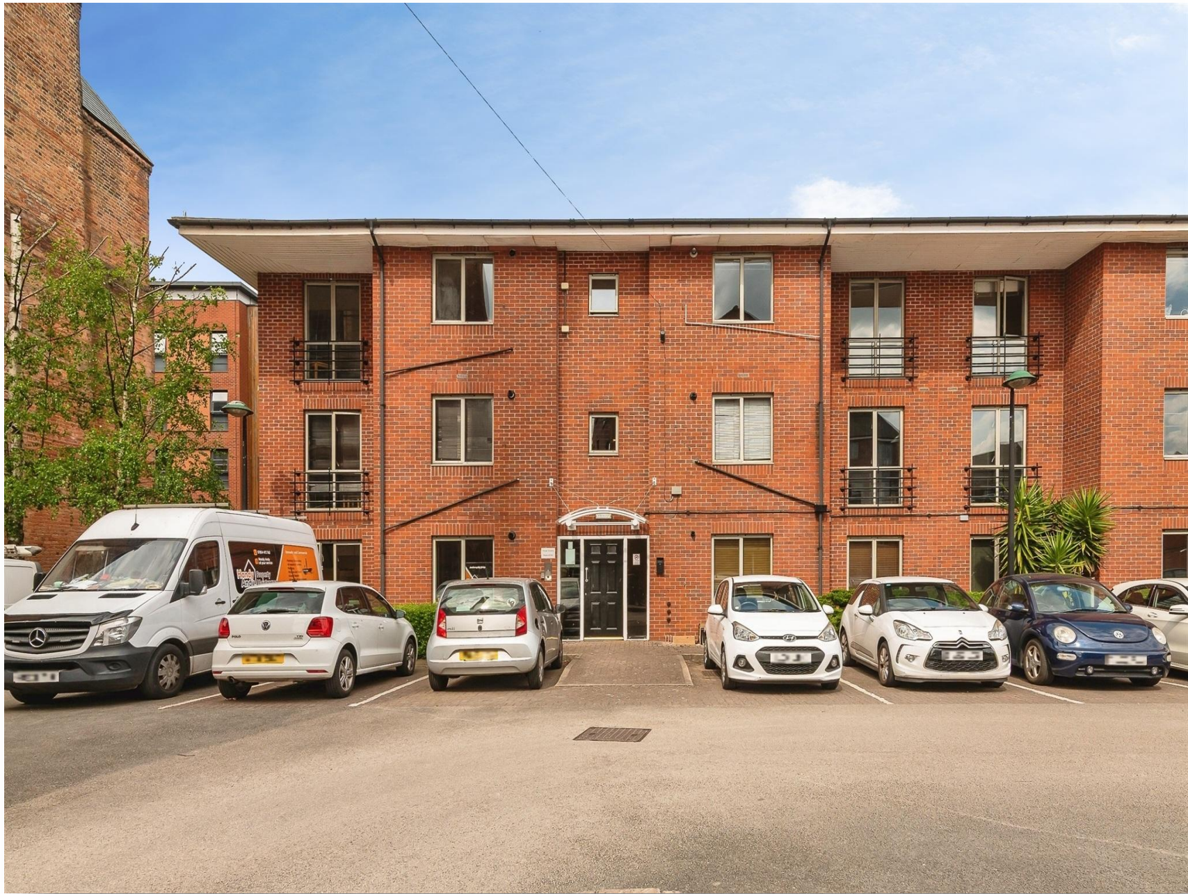
Royal Victoria Court Gamble Street, Nottingham NG7 4ET