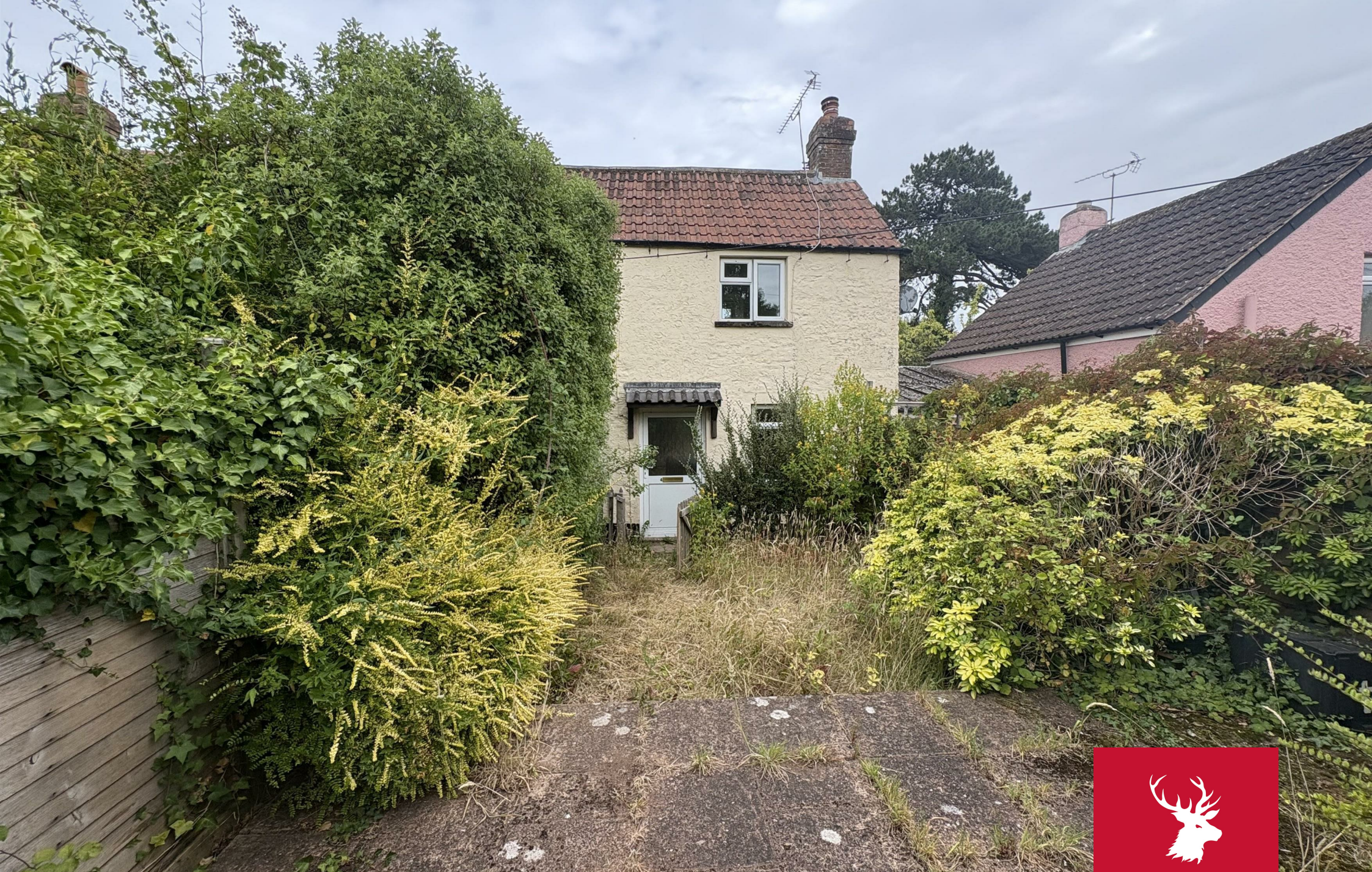
4 Butts Cottages