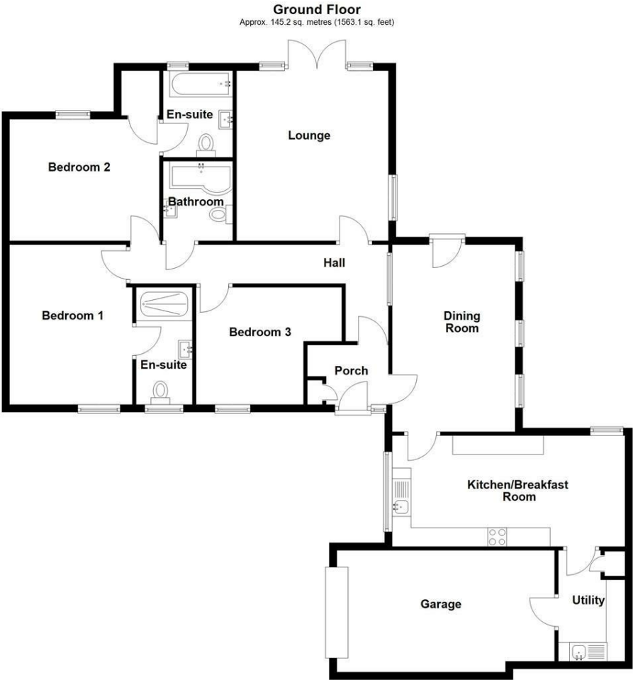
Total area: approx. 145.2 sq. metres (1563.1 sq. feet)