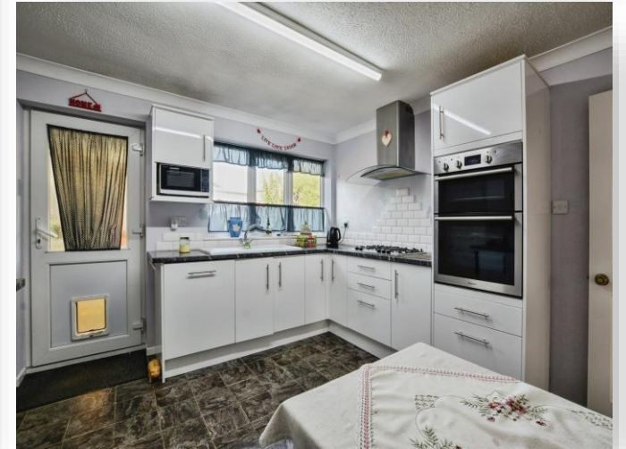
Gleneagles Drive, Skegness PE25 1DR