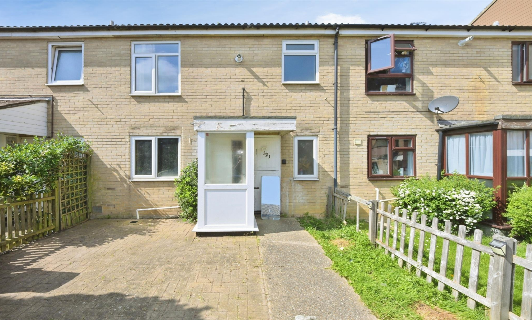
Taylifers, Harlow CM19 5RG