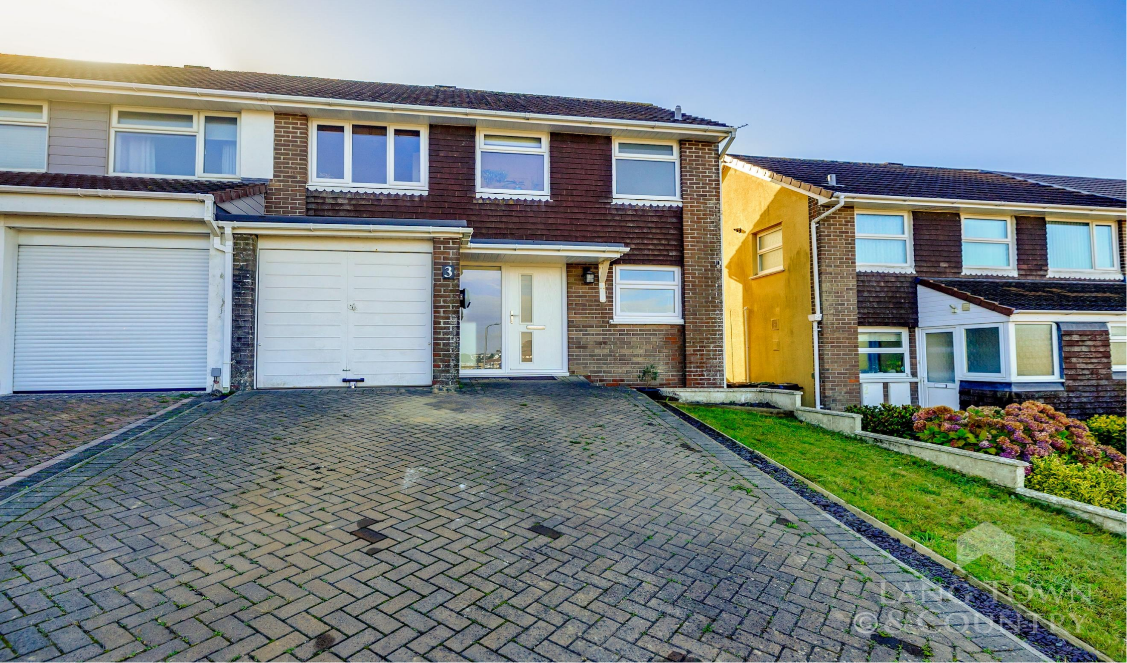
3 Goswela Gardens, Goosewell, Plymouth, Devon, PL9 9JG