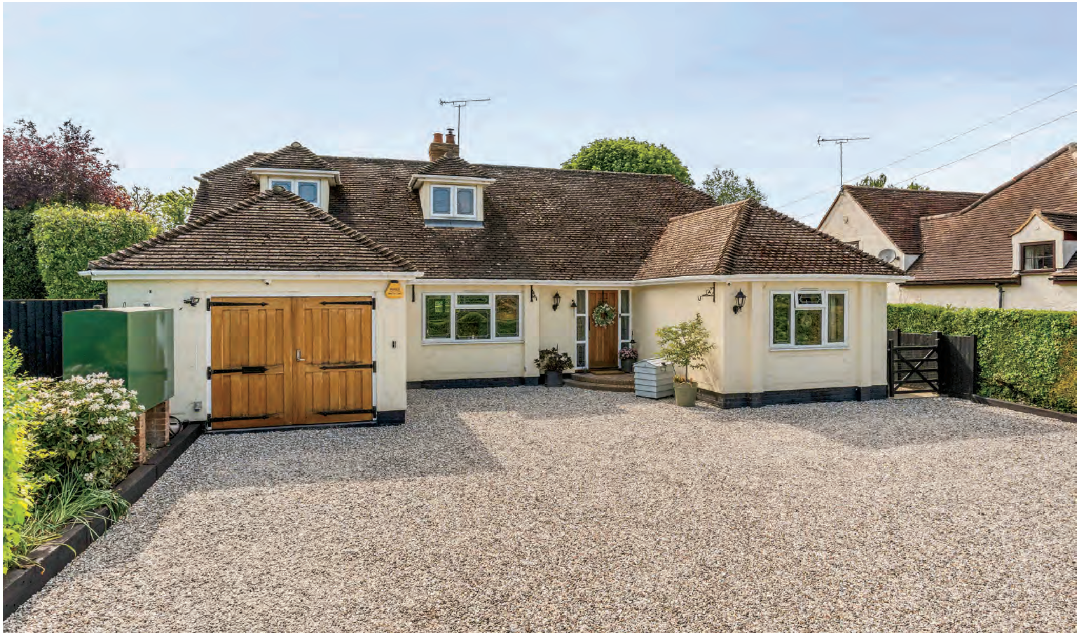
Grebe House Chelmsford Road | Purleigh | Chelmsford | Essex | CM3 6QN