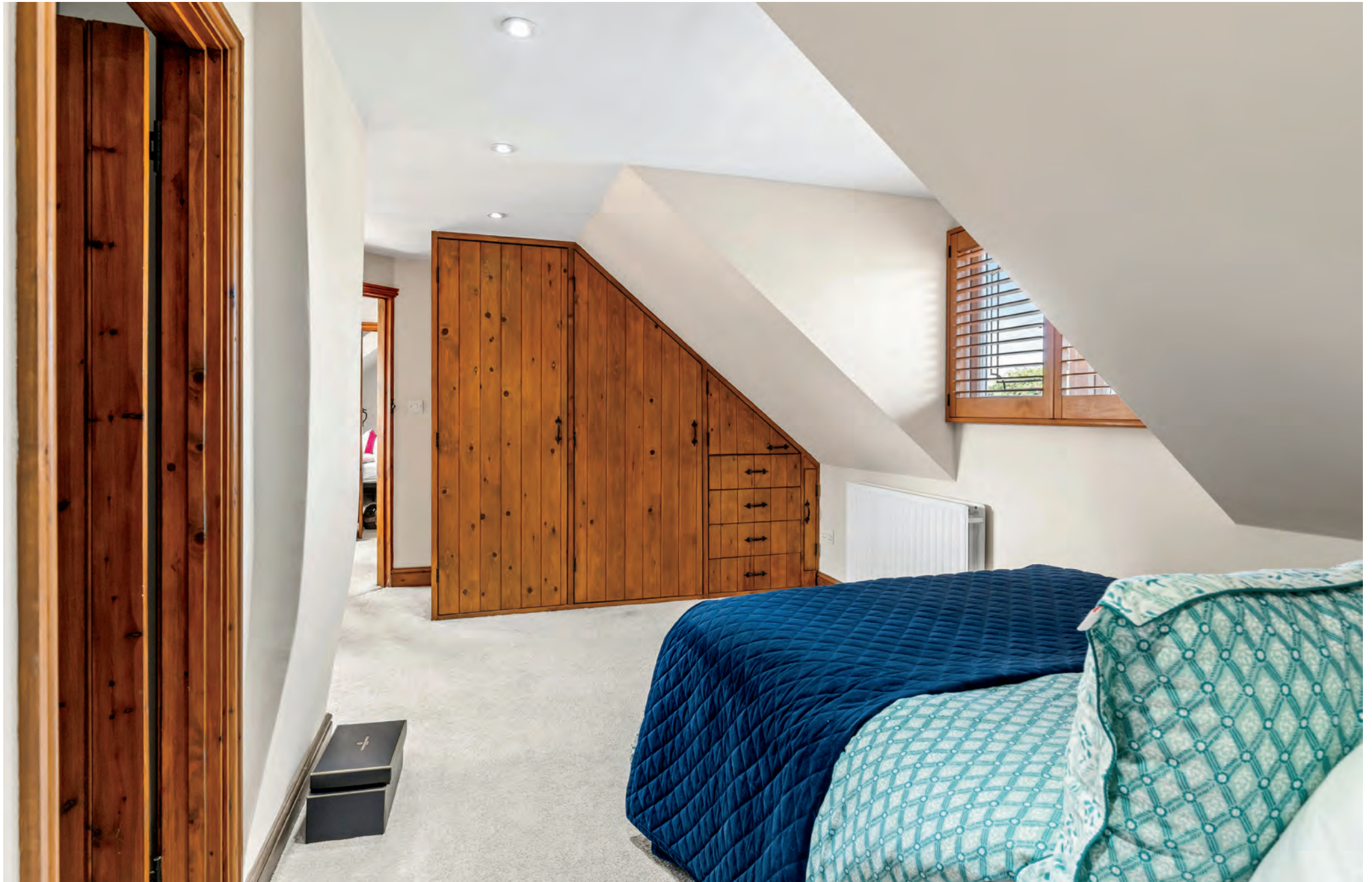
The first floor is accessed via two separate staircases, enhancing both privacy and flexibility. Four well-proportioned bedrooms are arranged across this level, including a principal suite with en-suite shower room and fitted wardrobes, an additional en-suite bedroom and two further generous bedrooms, all presented to an excellent standard. Built-in wardrobes provide ample storage throughout.