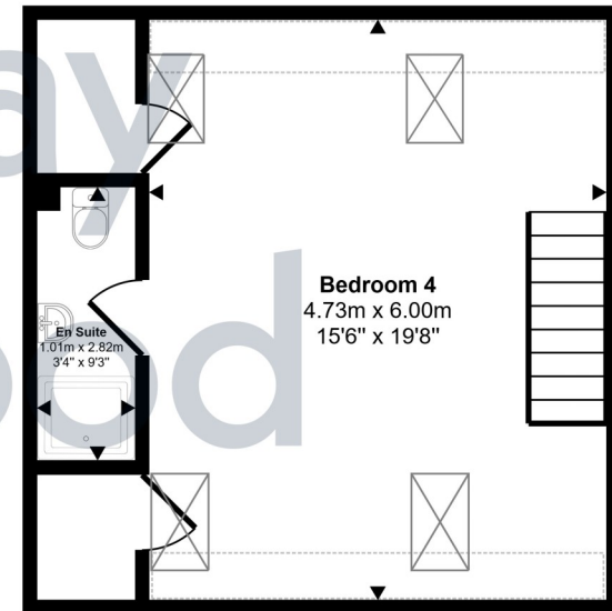
Second Floor Approx 35 sq m / 380 sq ft