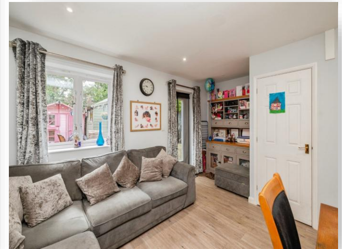
Cottage End, Aylsham, Norwich, NR11 6YB