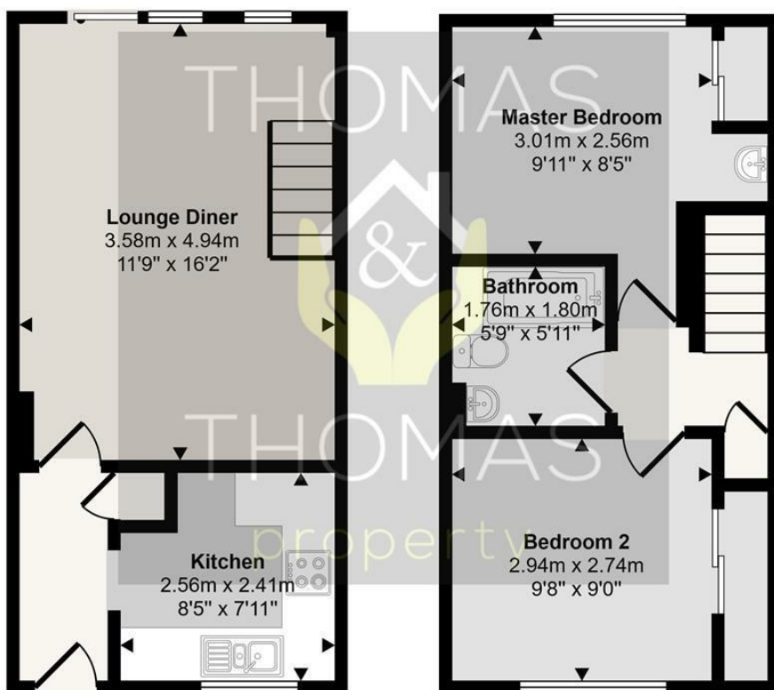
Ground Floor Approx 27 sq m / 293 sq ft

Approx Gross Internal Area 54 sq m / 580 sq ft