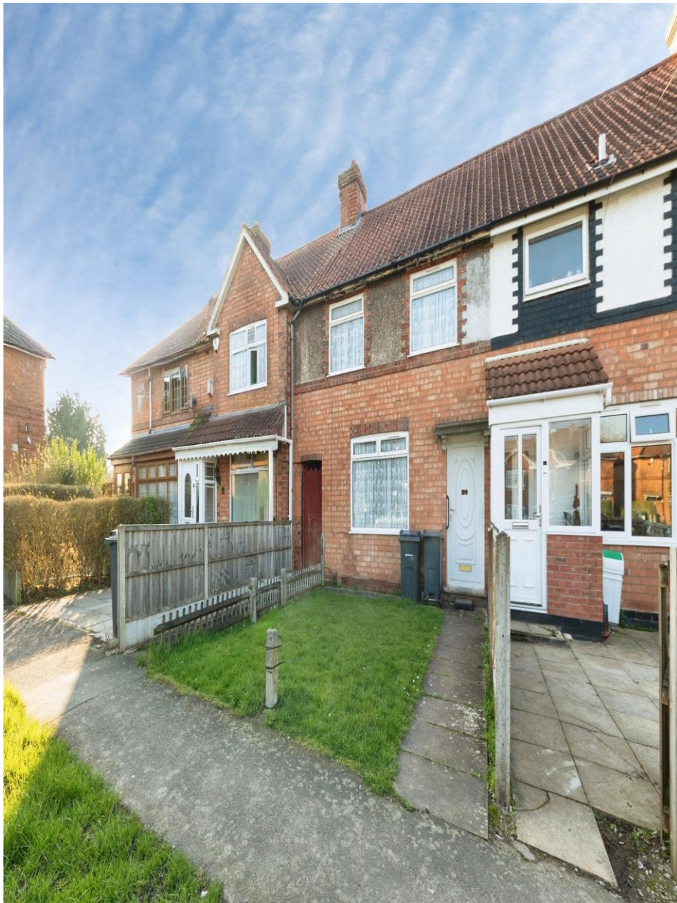
Mapleton Road, BIRMINGHAM B28 9RA