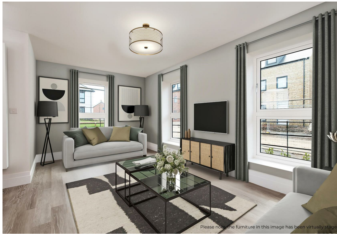
Please note, the furniture in this image has been virtually staged