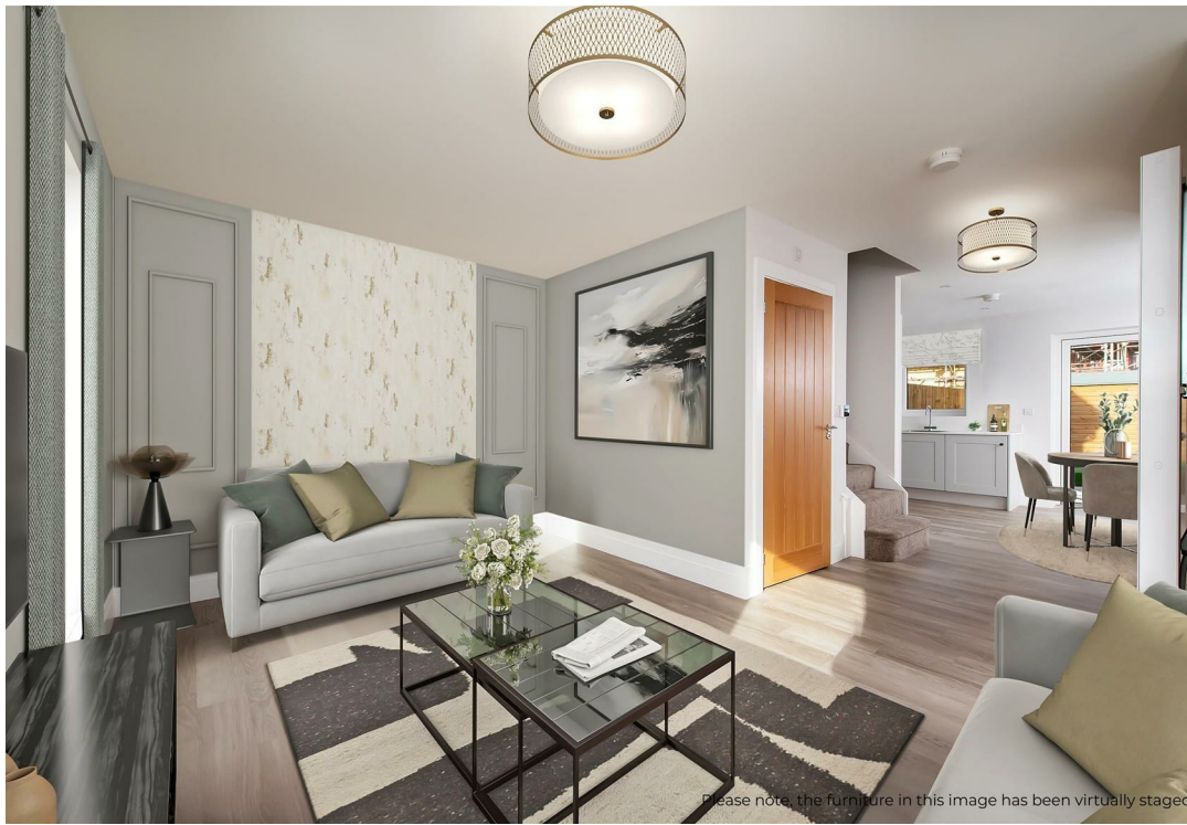
Please note, the furniture in this image has been virtually staged