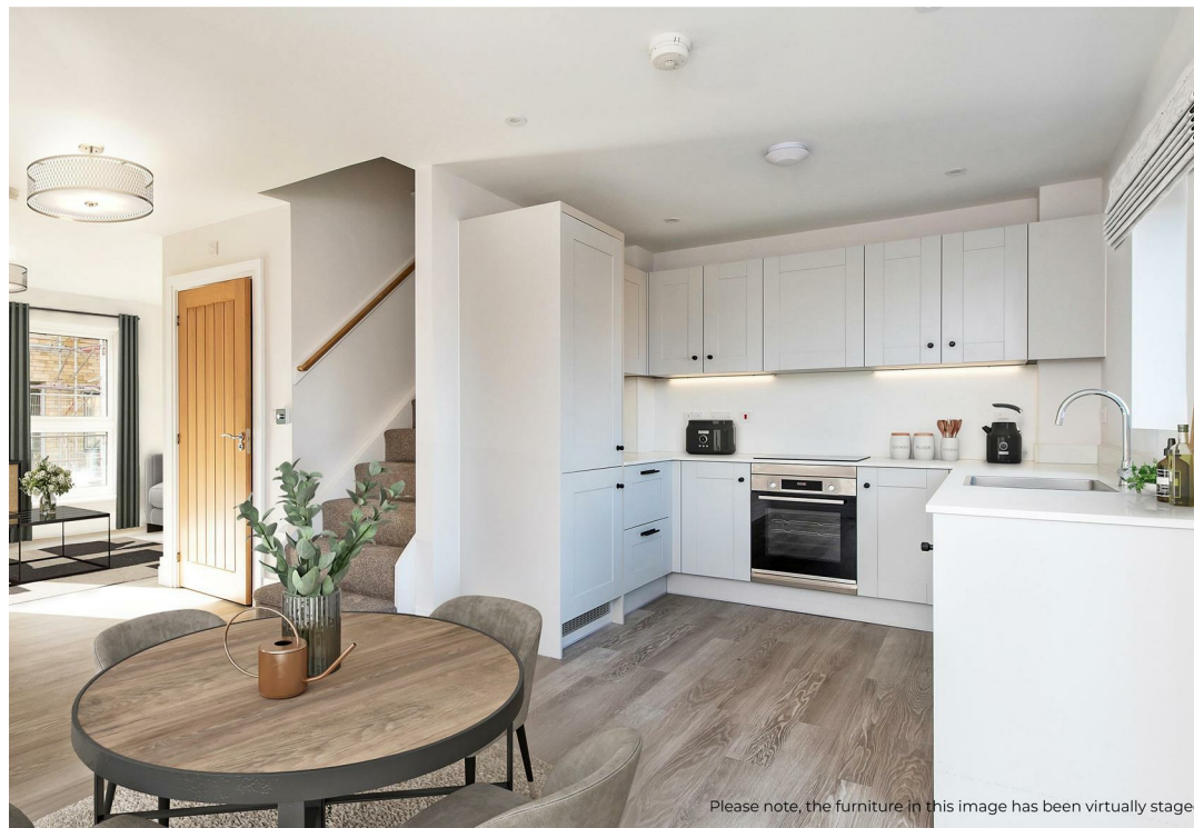
Please note, the furniture in this image has been virtually staged