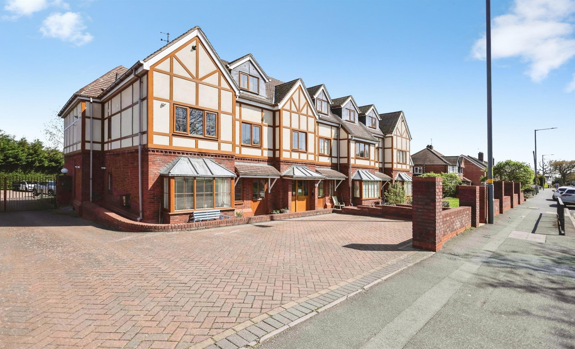
Burrows Manor Barrows Lane Birmingham