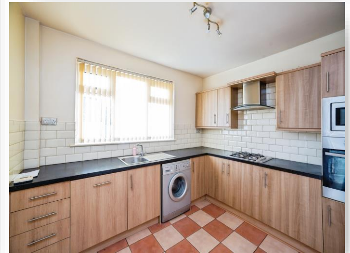
The Crescent, Bolton-Upon-Dearne Rotherham S63 8HS