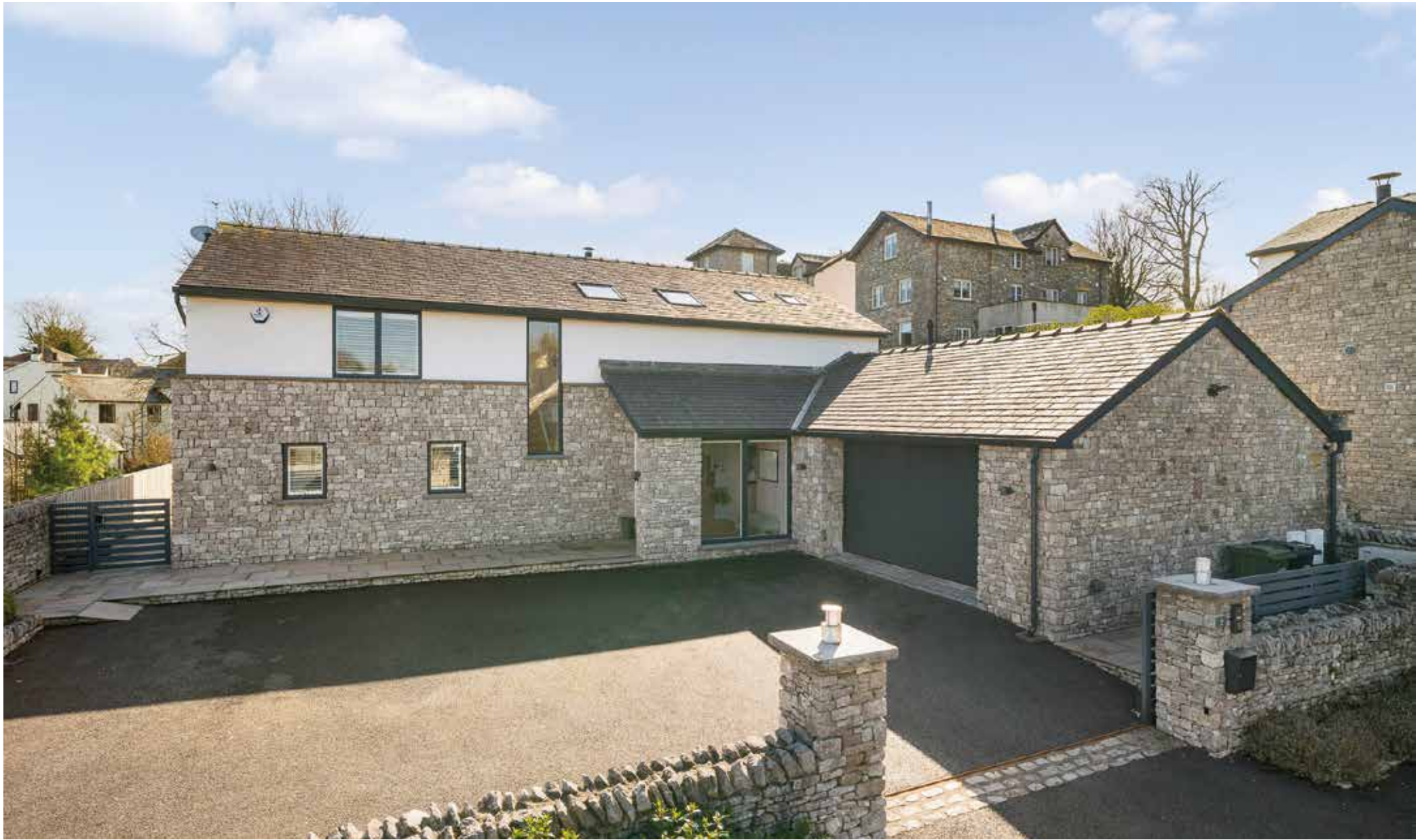
2 Lowgate Kirby Lonsdale | Carnforth | Lancashire | LA6 2FY