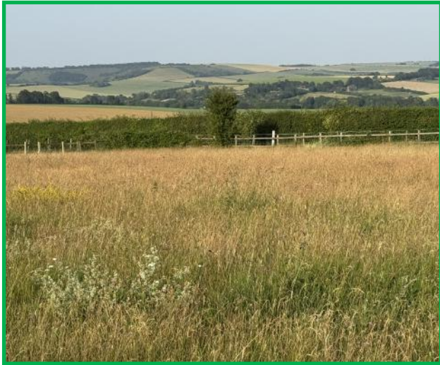
View across the Valley to Old Winchester Hill