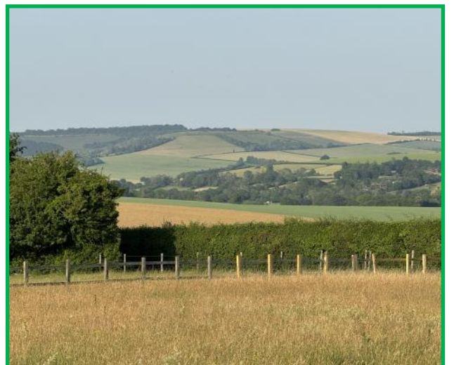
View across the Valley to Old Winchester Hill