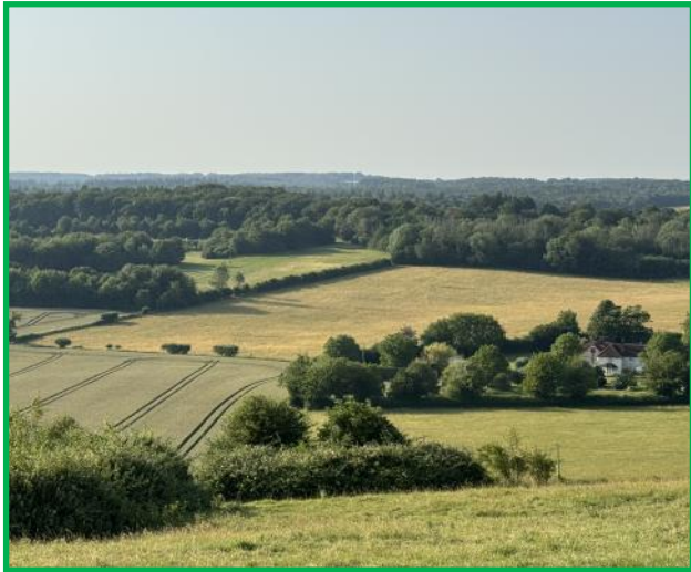
View north to Hazelholt and Preshaw