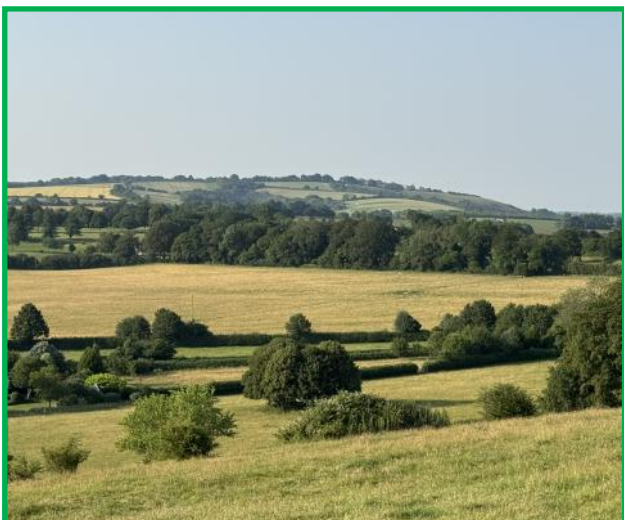
View towards Corhampton Golf Course