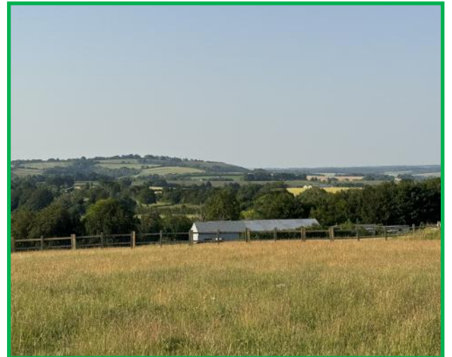
View north to Beacon Hill