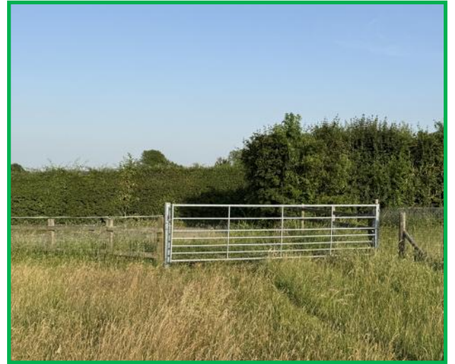
Access off Park Lane