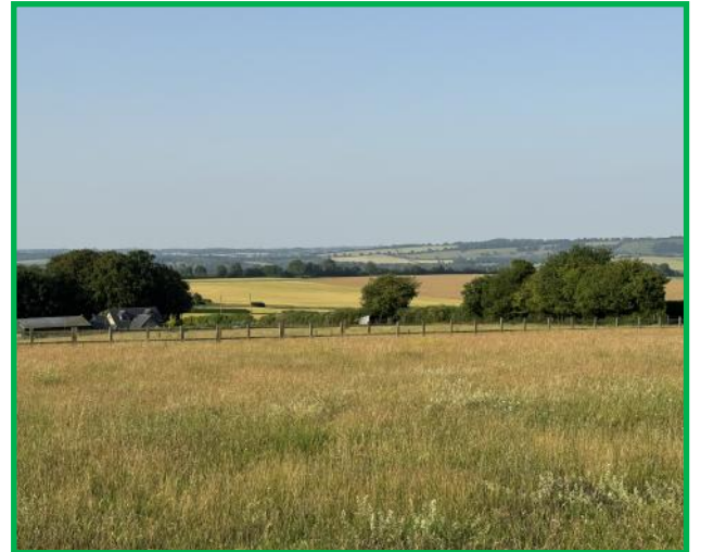
View North east over the Meon Valley