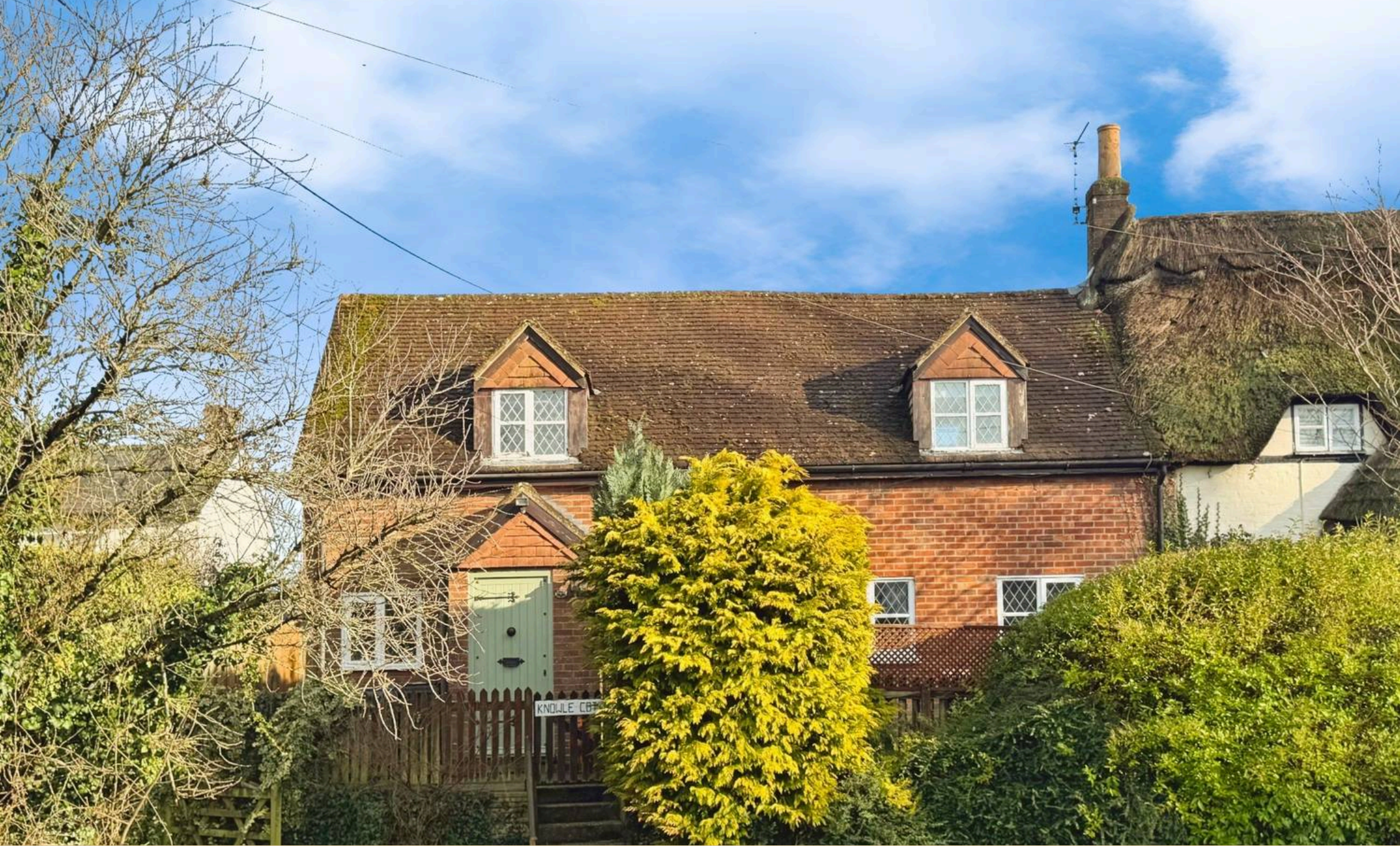
Knowle Cottage, Knowle £375,000