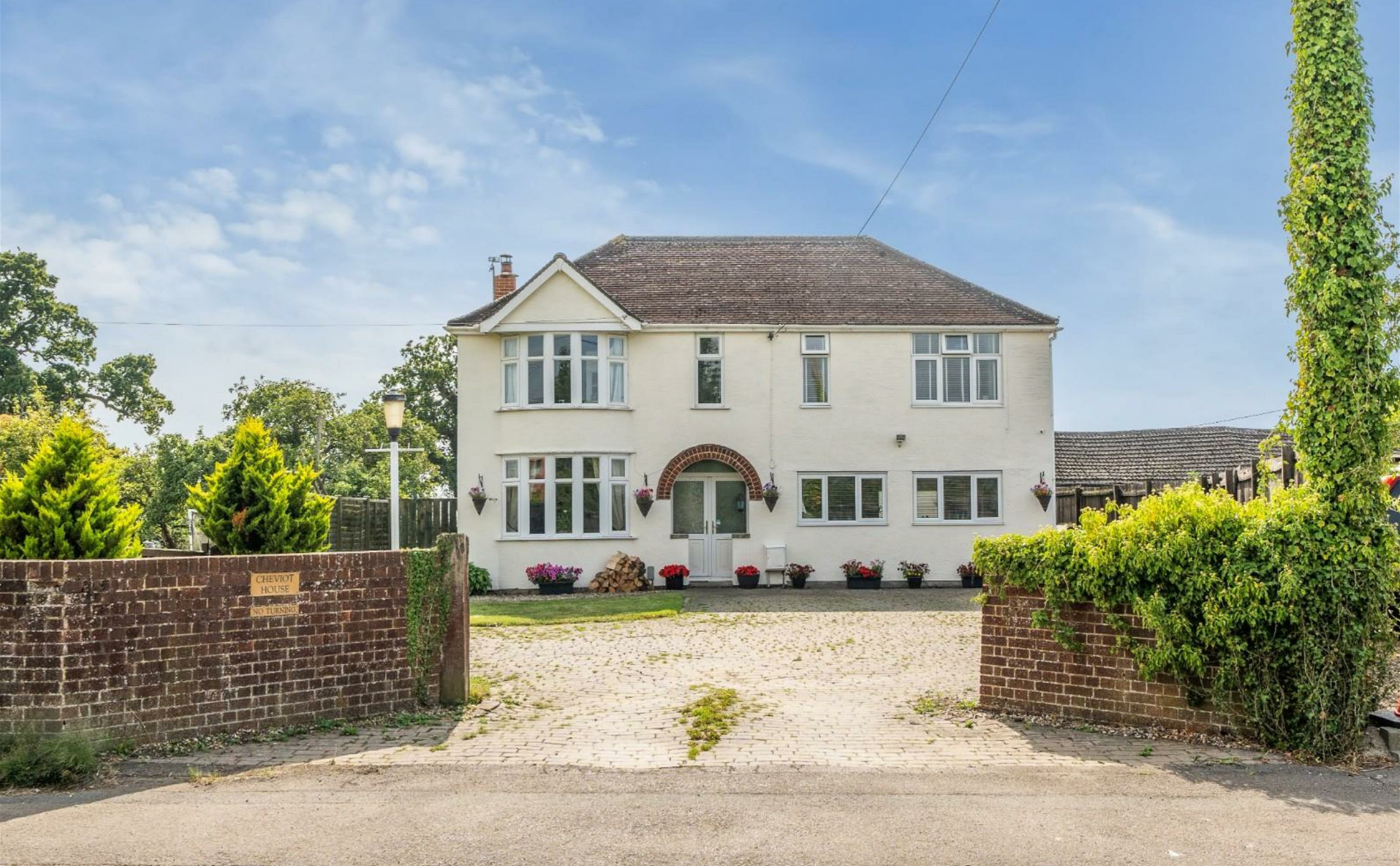
Cheviot House, Claypits, Stonehouse GL10 3AJ