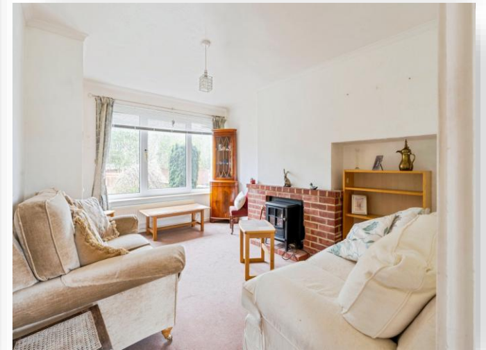
Grafton Gardens, Sompting Lancing BN15 9SP