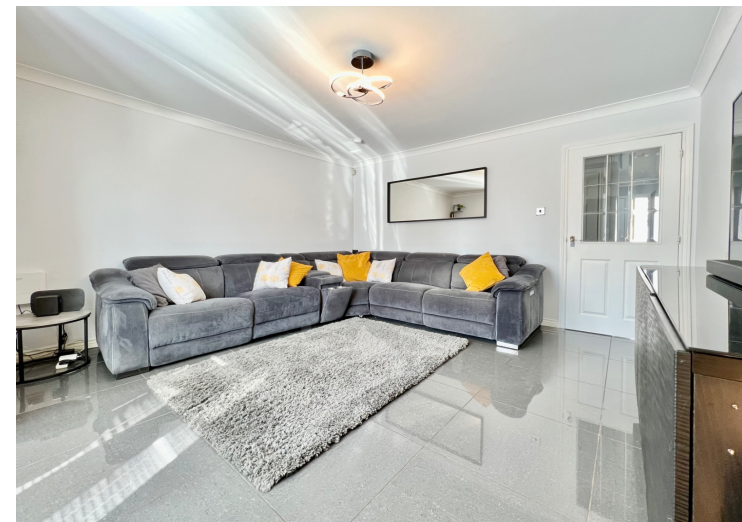
Kittyshaw Place, Dalry