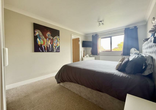
Bedroom 2 17'5 x 12'10 (5.31m x 3.91m)