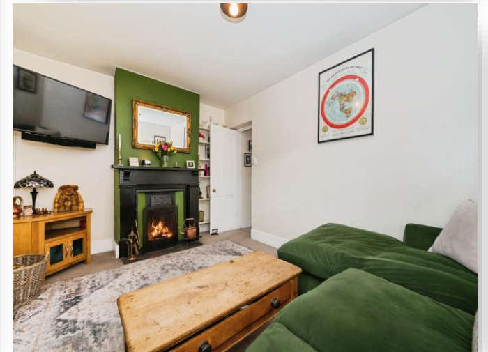
St. Johns Road, Eastleigh, SO50 4GX