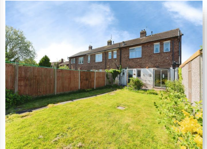
Pooltown Road, Whitby Ellesmere Port CH65 7BU