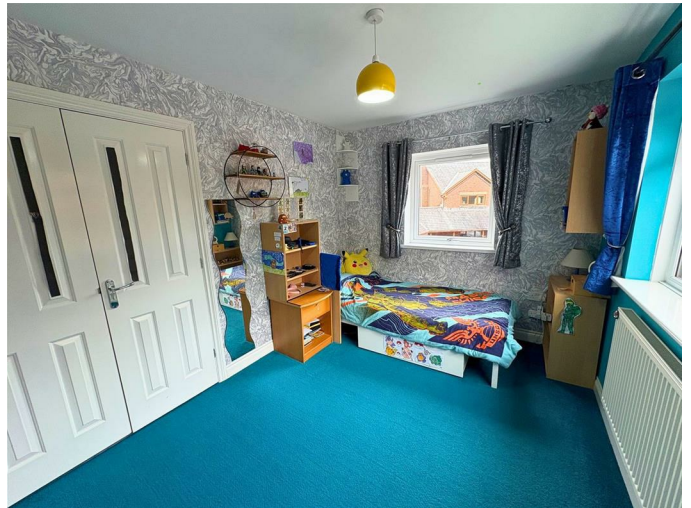
Bedroom Three 11'8" x 8'6" (3.56 x 2.61)

Skimmed ceiling, skimmed and papered walls, fitted carpet, radiator, built-in wardrobe, dual aspect - uPVC double glazed windows to the front and side.