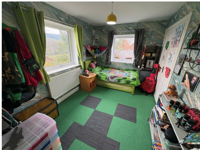
Bedroom Four 11'7" x 8'5" (3.55 x 2.57)

Skimmed ceiling, skimmed and papered walls, fitted carpet, radiator, built-in wardrobe, dual aspect - uPVC double glazed windows to the side and rear.