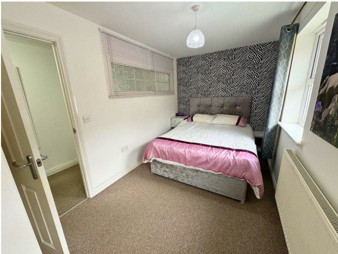
Bedroom Two 14'2" x 7'6" (4.33 x 2.30)

Skimmed ceiling, skimmed walls with papered feature wall, fitted carpet, radiator, storage cupboard, two uPVC double glazed windows to the front, door into:-