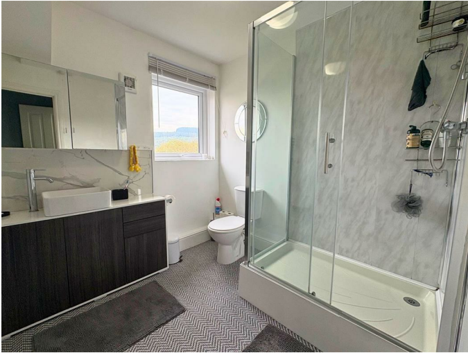
Master En-suite 7'6" x 7'4" (2.30 x 2.25)

Skimmed ceiling, skimmed walls, fitted carpet, ceramic heated towel rail, three piece suite comprising a double shower enclosure, vanity wash hand basin and a low level W.C., uPVC double glazed window to the rear.