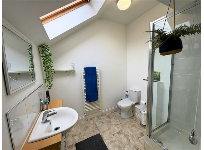
Guest En-suite 7'6" x 6'7" (2.31 x 2.01)

Skimmed ceiling with Velux window, skimmed walls, tile effect vinyl flooring, ceramic heated towel rail, three piece suite comprising a shower enclosure, vanity wash hand basin and a low level W.C., uPVC double glazed window to the rear.