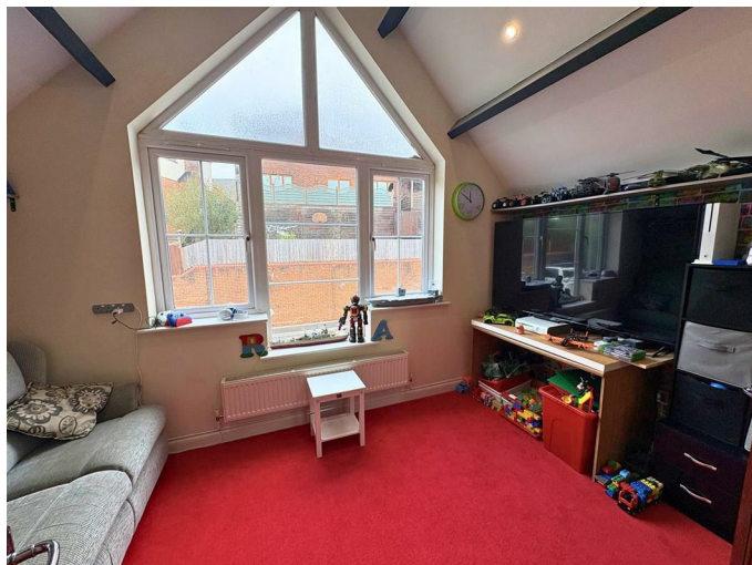
Bedroom Five 13'1" x 7'11" (4.01 x 2.43)

Vaulted skimmed ceiling with spotlights, skimmed and papered walls, fitted carpet, dwarf radiator, two uPVC double glazed windows to the front.