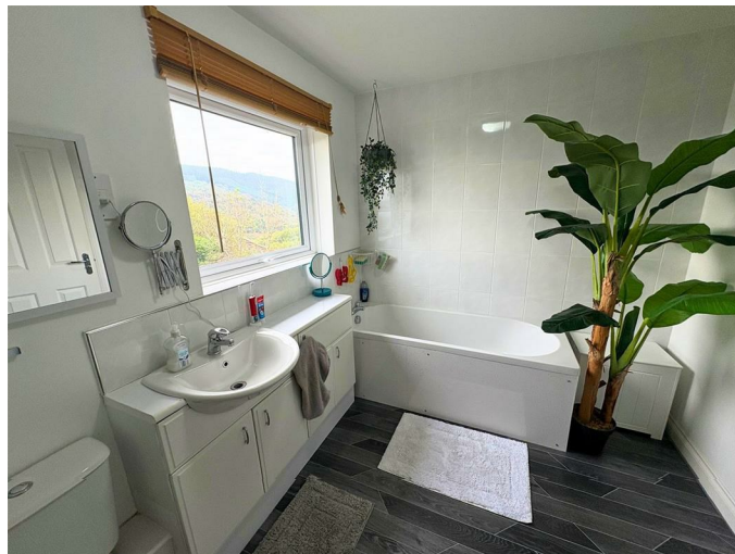
Family Bathroom 10'0" x 7'6" (3.05 x 2.30)

Skimmed ceiling, skimmed and tiled walls, wood effect vinyl flooring, ceramic heated towel rail, four piece suite comprising a panel bath, shower enclosure, vanity wash hand basin and a low level W.C., uPVC double glazed window to the rear.