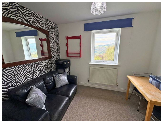
Bedroom Six / Office 9'8" x 7'7" (2.97 x 2.33)

Skimmed ceiling, skimmed walls with papered feature wall, fitted carpet, radiator, uPVC double glazed window to the rear.