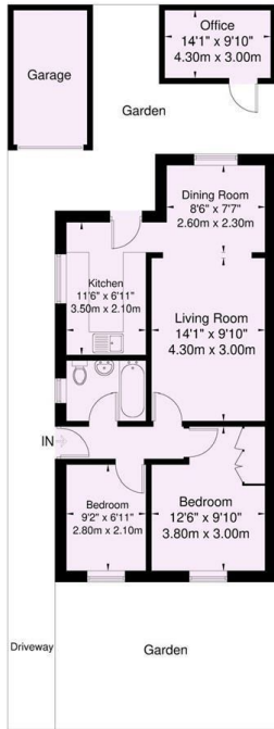
ILLUSTRATION FOR IDENTIFICATION PURPOSES ONLY ALL MEASUREMENT ARE MAXIMUM, AND INCLUDE WINDOW BAYS AND WARDROBES WHERE APPLICABLE THIS PLAN MUST NOT BE REPRODUCED BY ANY OTHER PERSON WITHOUT PERMISSION