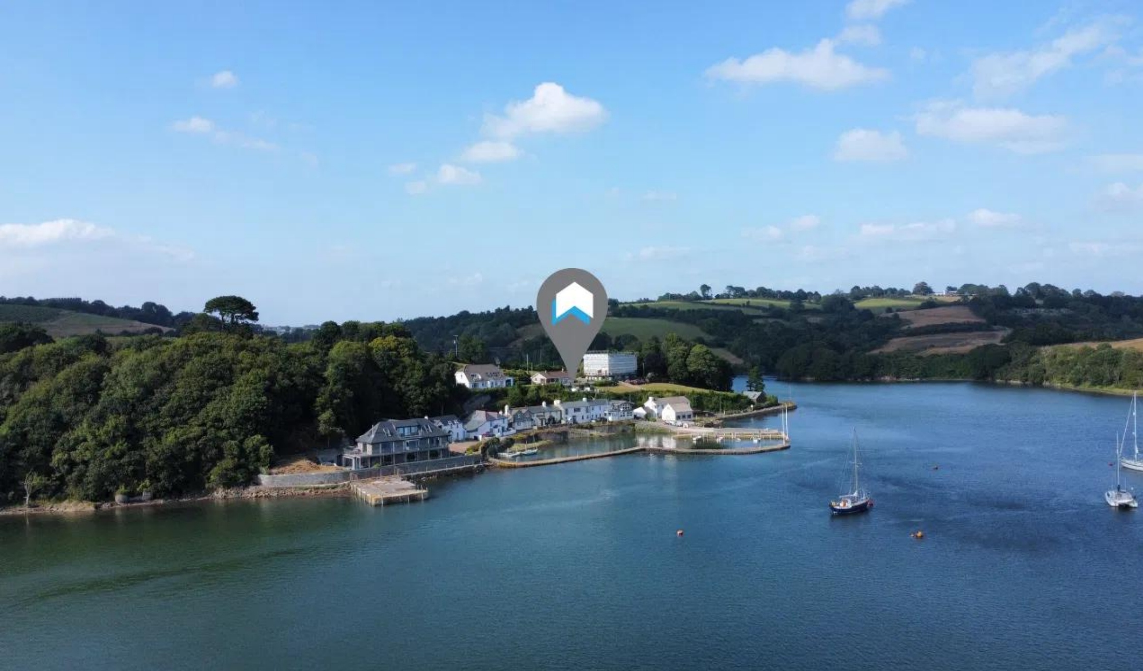
Lynher House, Antony Passage, Saltash, Cornwall, PL12 4QT