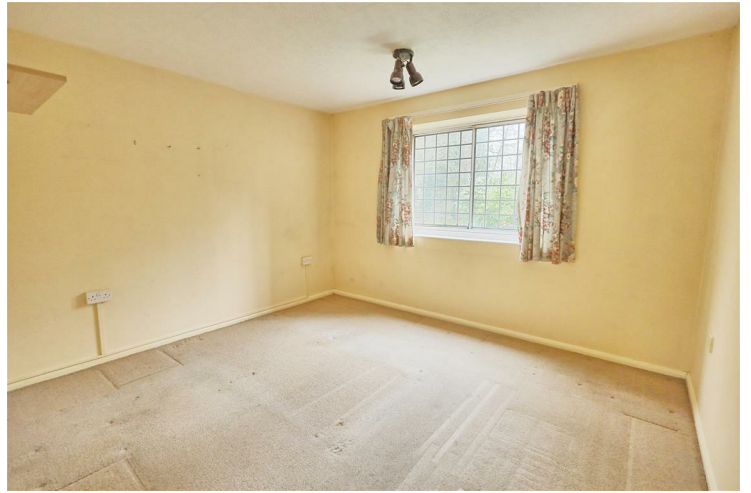
BEDROOM 11'10" x 10'5" (3.61 x 3.19)