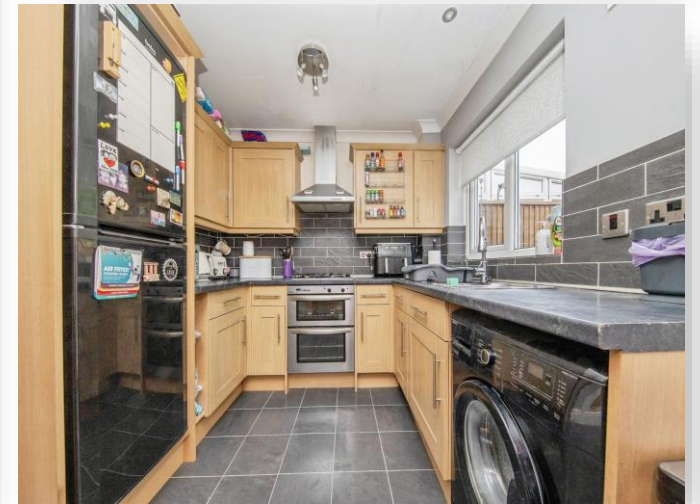
Wentworth Drive, Ipswich, IP8 3RX