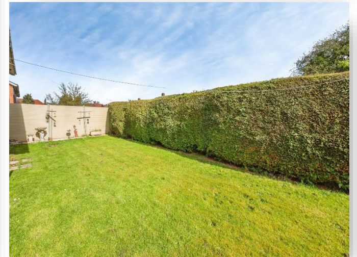
Addison Close, Coltishall NR12 7JA