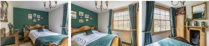
Bedroom 2 10'11" x 7'8" (3.35 x 2.35)