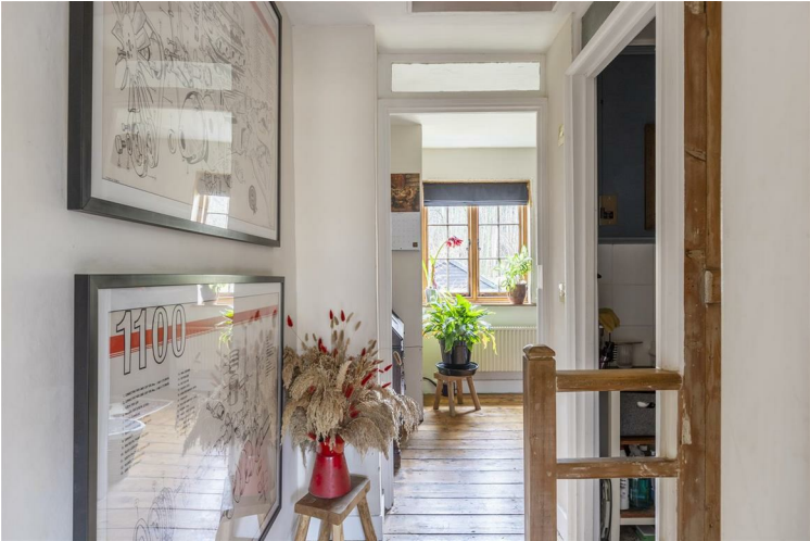
Bedroom 1 10'11" x 9'10" (3.35 x 3)