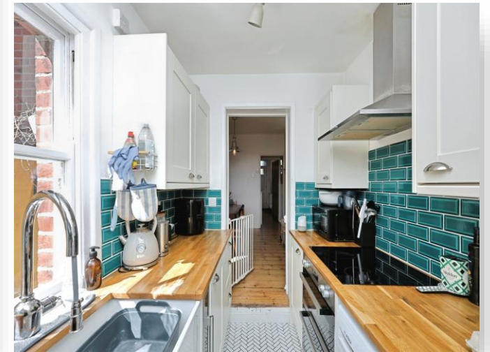
Spencer Street, Norwich, NR3 4PA