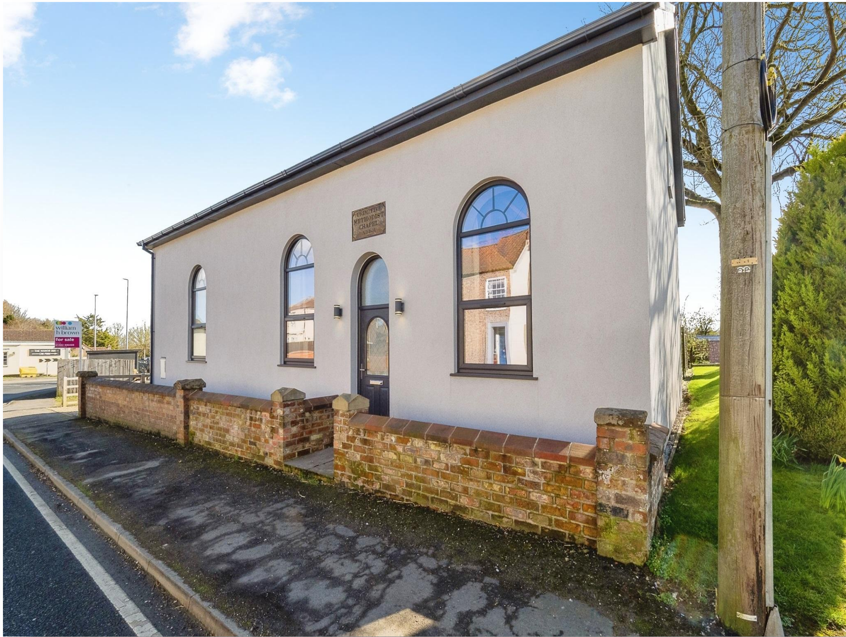
Chapel House Fridaythorpe, Driffield, YO25 9RS