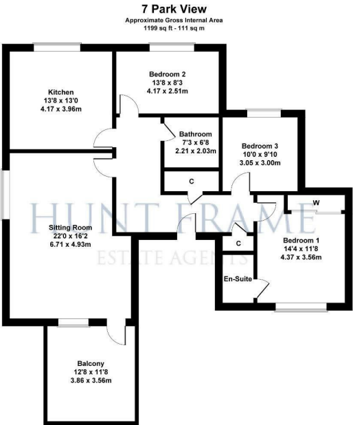
Not to Scale. Produced by The Plan Portal on behalf of Hunt Frame. For Illustrative.