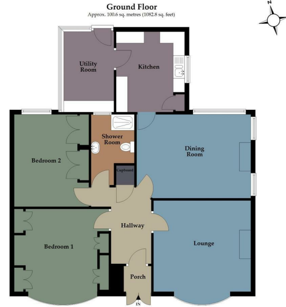
Total area: approx. 100.6 sq. metres (1082.8 sq. feet)

Astleys use all reasonable endeavours to supply accurate property information in line with the consumer protection from unfair trading regulations 2008. These property details do not constitute any part of the offer or contract and all measurements are approximate. The matters in these particulars should be independently verified by prospective purchasers and it should not be assumed this property has all the necessary building regulations and planning permissions. Any heating, services and appliances have not been checked or tested. Floor plan is not to scale and is for illustrative purposes only. Plan produced using PlanIt.