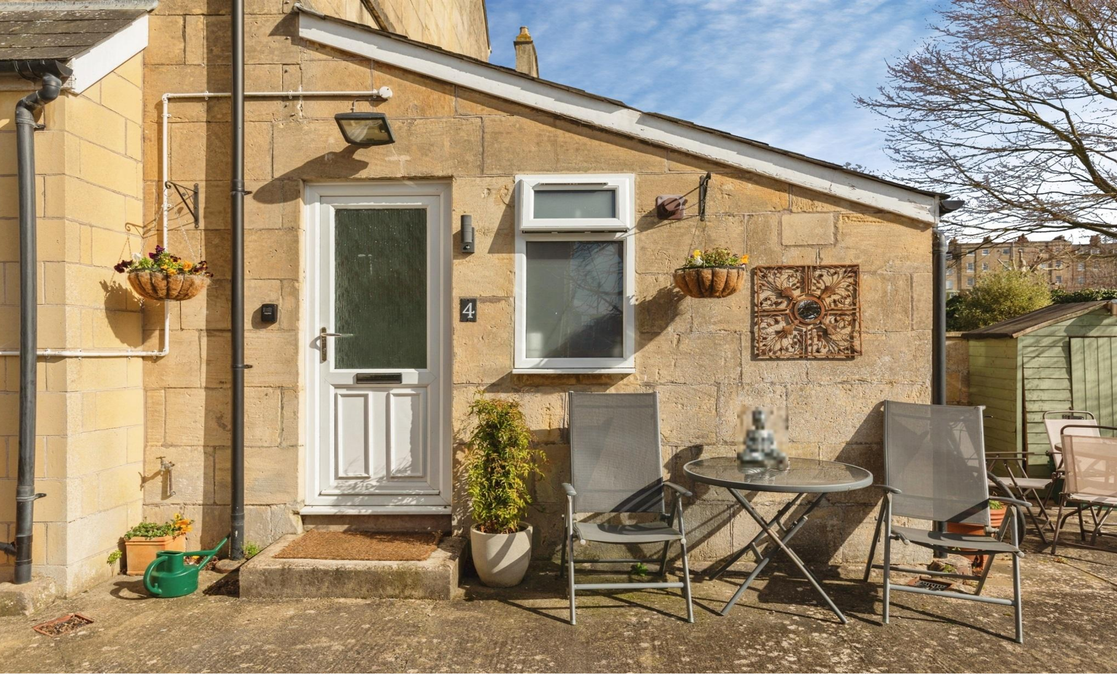
Flat 4 Bloomfield Avenue, Bath BA2 3AB