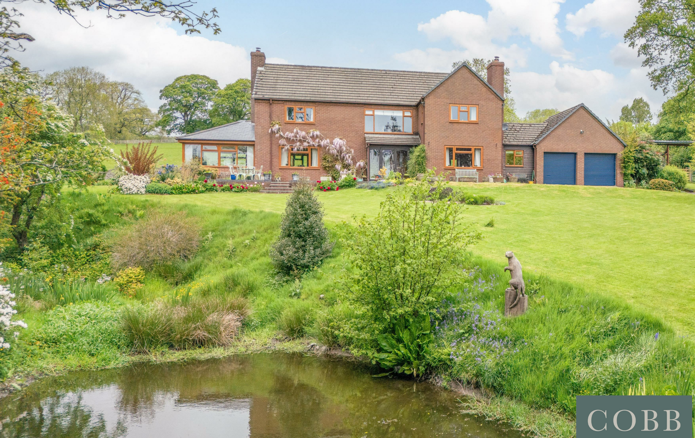
Osbern House, House with land, Kinnerton, Nr New Radnor, LD8 2PE Guide Price £695,000