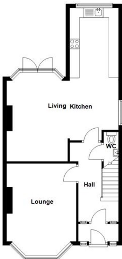
Ground Floor Approx. 58.3 sq metres (627.6 sq. feet)