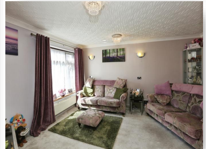
The Mount, Gosport PO13 0ZZ