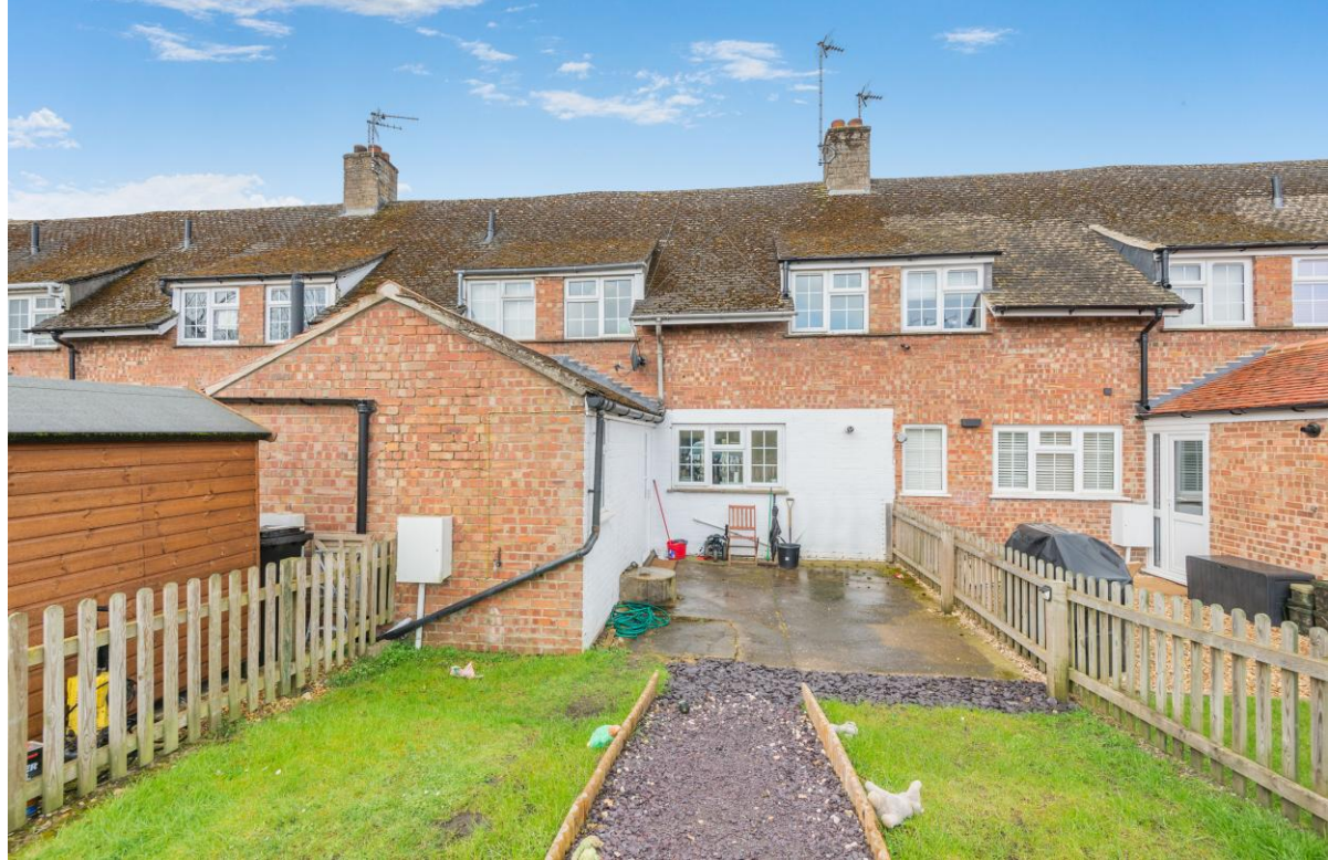
Main Street Great Casterton, Stamford Approximate Gross Internal Area 747 Sq Ft/69 Sq M