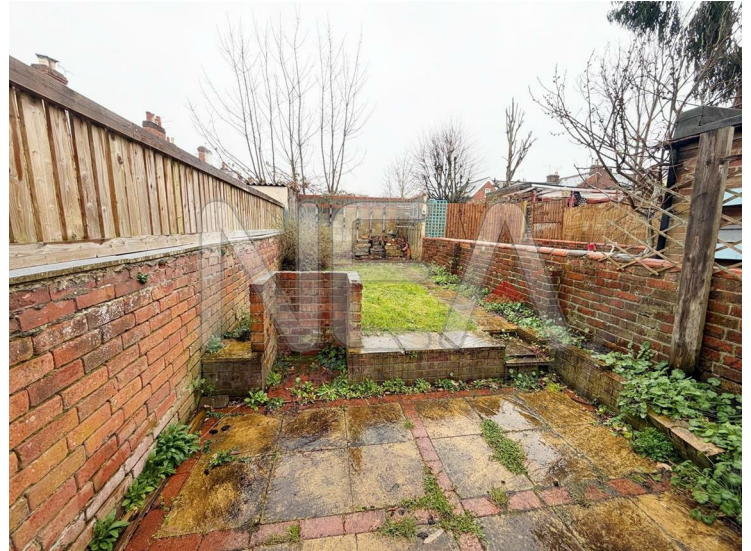
Patio area leading to a garden with a footpath.