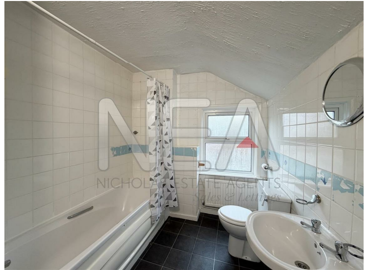
Bathroom fitted with a W/C, pedestal sink, bath with shower attachment, frosted window, and storage cupboard.