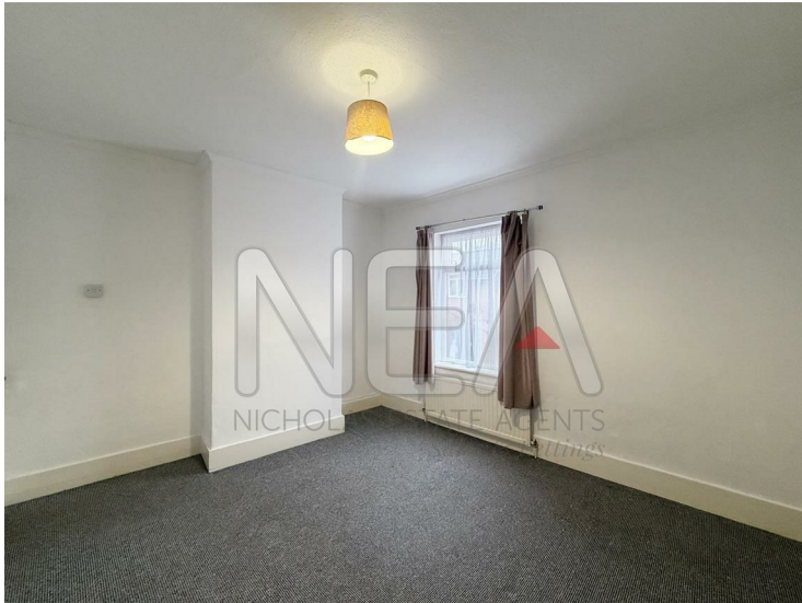
Carpeted bedroom with a front-facing window overlooking the quiet street.