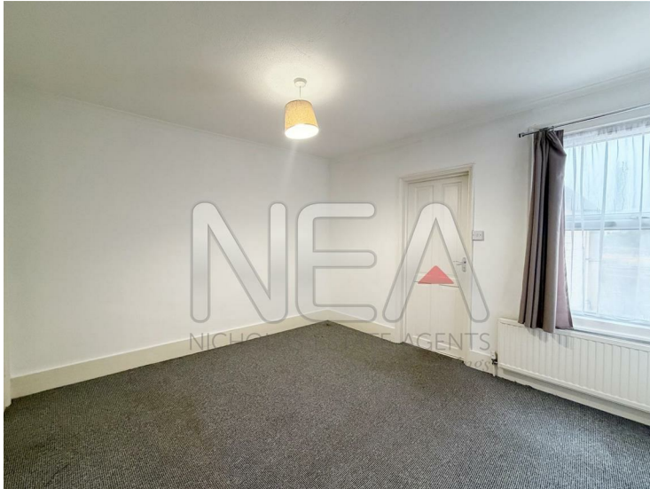
Carpeted bedroom with built-in wardrobe and a rear-facing window overlooking the garden. Door to bathroom.