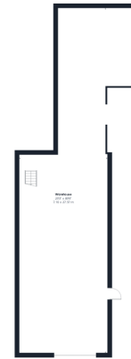
Ground Floor Building 4