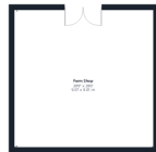
Ground Floor Building 3