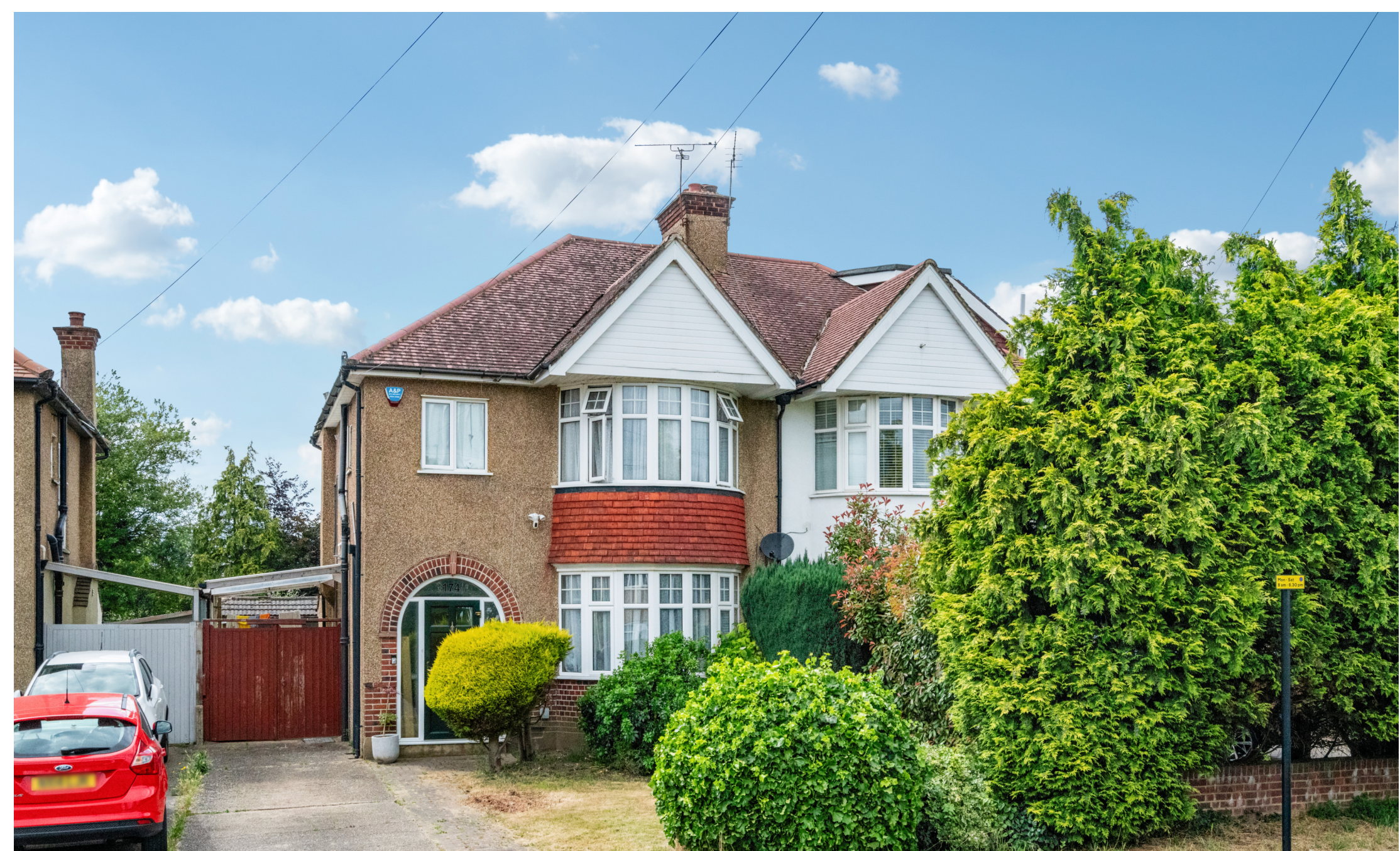
A well presented three bedroom family home Headstone Lane, Harrow, HA2 6LY